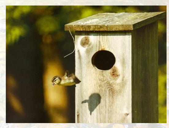
A newly hatched Wood Duck leaps from its nest box. After the duckling reaches the ground, it will follow its mother to water.

Migratory ducks aren't just valued by human hunters, they are essential to the local ecology as a food source for predators including bald eagles, owls, foxes and raccoons. To quote local hunter and wildlife enthusiast Terry Godfrey: "Everything feeds something else".